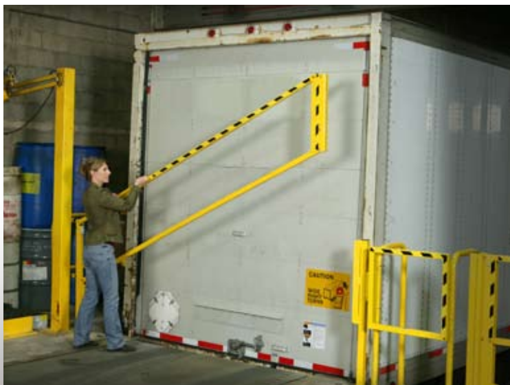
Straight-Rail Gate is ideal for standard dock widths.

"The Wildeck® EdgeGard™ gate is far superior for protecting personnel near our loading dock than the old chain gate we were using. When the EdgeGard is lowered into position, it's less likely that an individual will stumble off the dock during active packaging or truck loading activity." – Satisfied Plant Manager