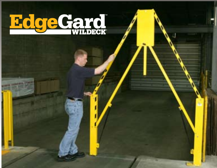
Unique Folding-Rail design protects wider areas and minimizes the required gate clearance height.

"The Wildeck® EdgeGard™ gate is far superior for protecting personnel near our loading dock than the old chain gate we were using. When the EdgeGard is lowered into position, it's less likely that an individual will stumble off the dock during active packaging or truck loading activity." – Satisfied Plant Manager