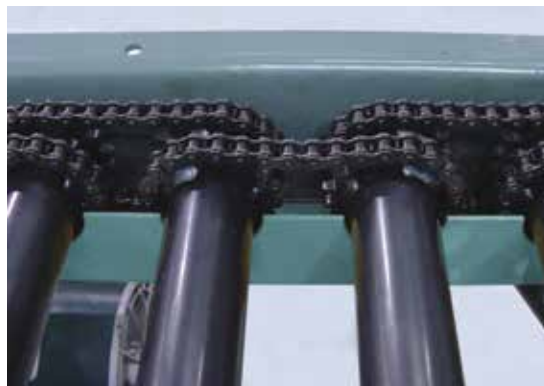
CHAIN GUARD REMOVED TO ILLUSTRATE ROLL TO ROLL DRIVE CHAIN.

WARNING: DO NOT OPERATE CONVEYOR WITH CHAIN GUARD REMOVED.