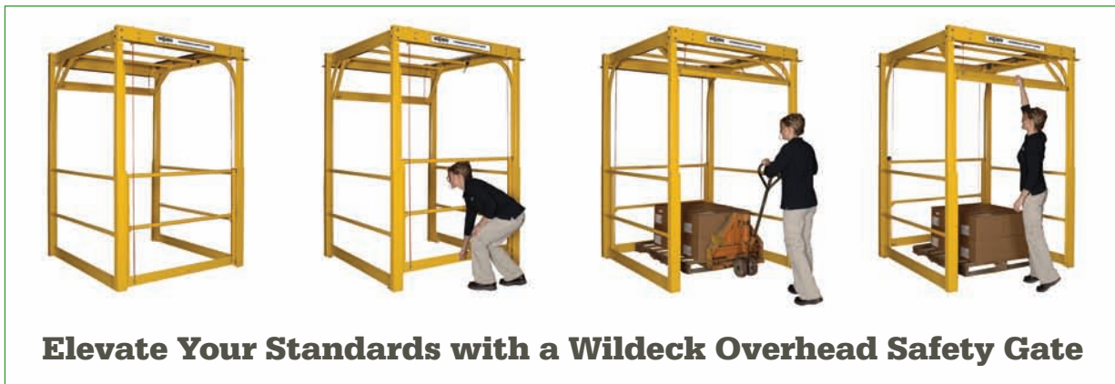
Elevate Your Standards with a Wildeck Overhead Safety Gate